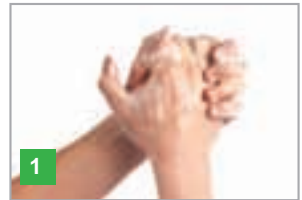
Wet hands, apply soap and lather palm to palm

Instructions on good hand washing techniques are given below: