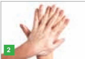
Clean between fingers; right hand over left and left over right