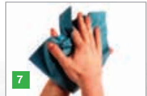
After washing, rinse hands under running water and dry thoroughly on paper towels