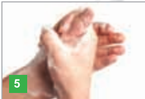
Clean left thumb with rotational movement of right hand and vice-versa