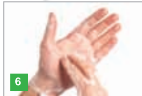
Rotational rubbing of palms; right fingers to left palm and vice-versa