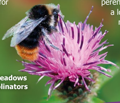
Wildflower meadows encourage pollinators

To find your local Trafford park visit www.trafford.gov.uk/parks . For green space updates, search #TraffordParks on Twitter.