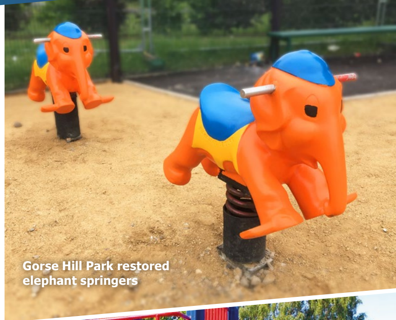
Gorse Hill Park restored elephant springers

Discover more about the green space capital programme for 2020-21 at www.trafford.gov.uk/parkmaintenance