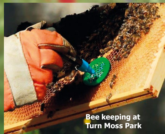
Bee keeping at Turn Moss Park

One Trafford is moving away from seasonal planting to instead installing perennial plants, which supports a longer lasting season of nectar sources for bees. Thousands of perennial bulbs such as native