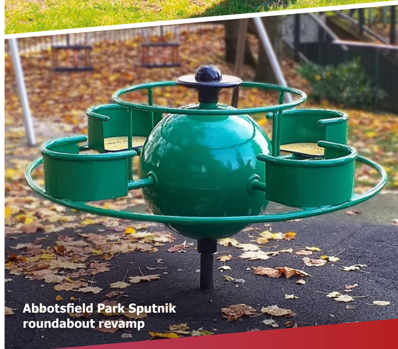
Abbotsfield Park Sputnik roundabout revamp