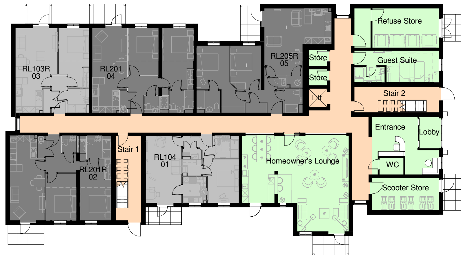
Ground Floor Plan 1 : 200

Rev: _____ Date: _____ Details: _____ Drawn by: _____ Checked by: _____