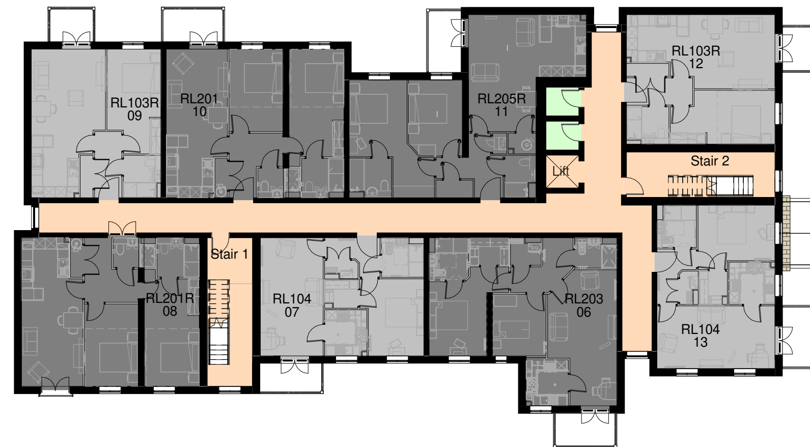
First Floor 1 : 200