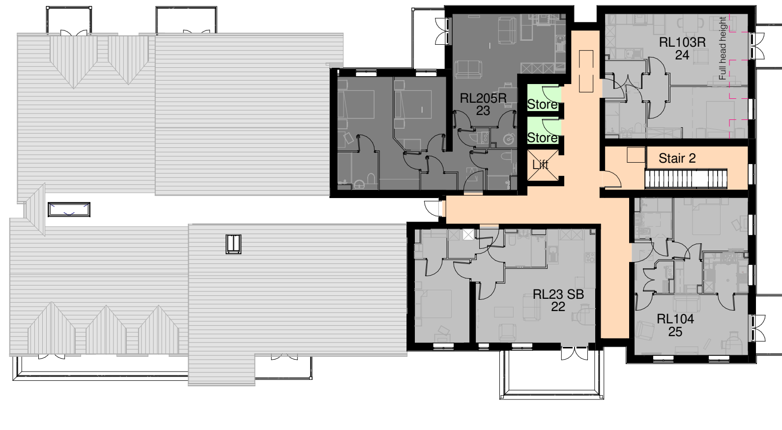
Third Floor Plan 1 : 200