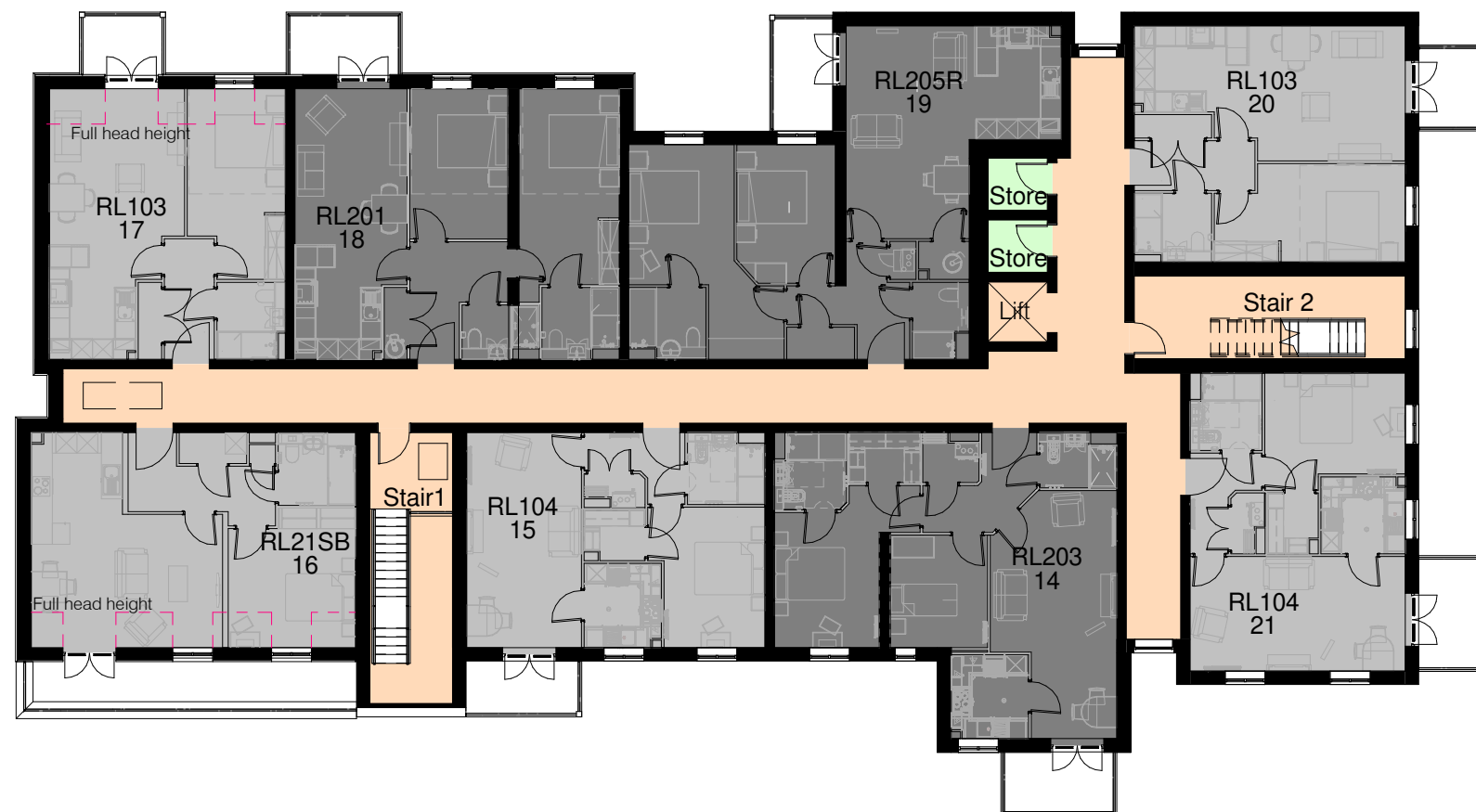
Second Floor Plan 1 : 200