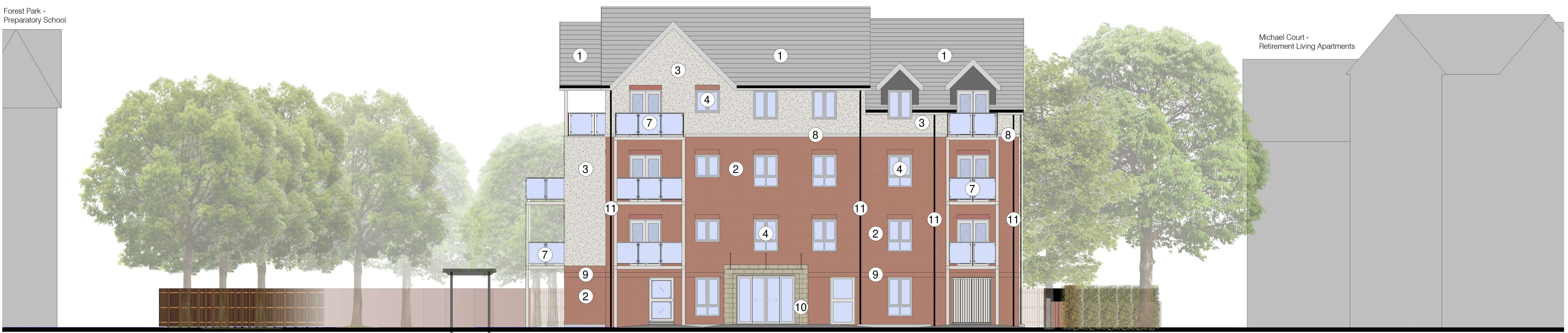
East Elevation 1 : 100