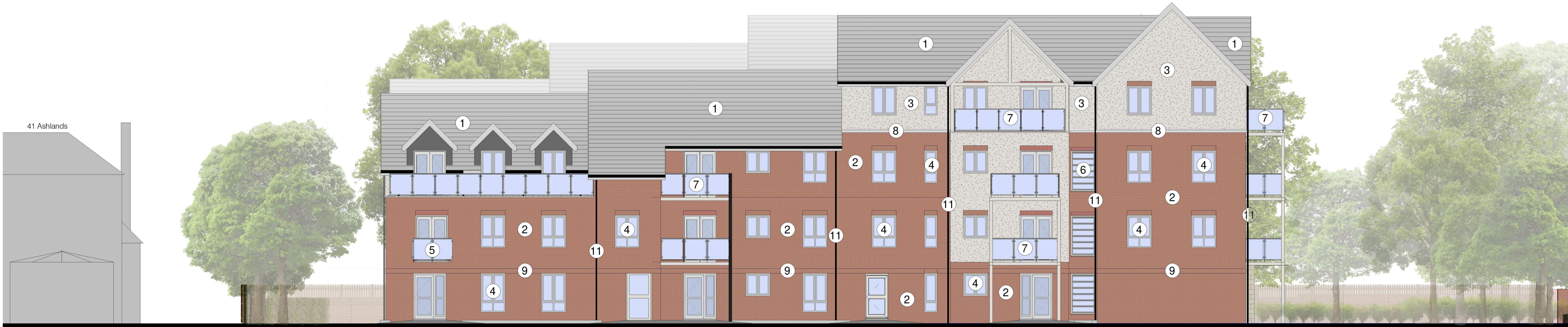
South Elevations 1 : 100