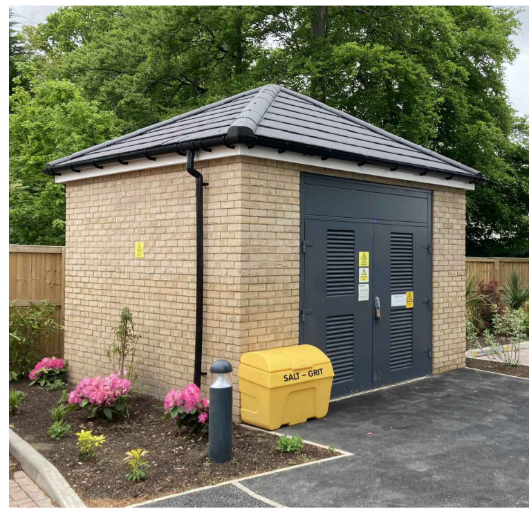
Gutters & downpipes