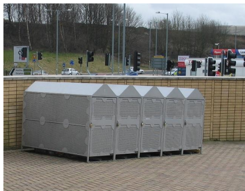
Fig 10: horizontal lockers

11.3.7 Other types of facilities than those listed above may be considered appropriate for long stay cycle parking. However, any variations must be approved by the Council's officer with responsibility for cycling. In the case of new or untried