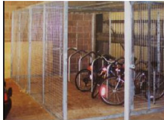
Fig 9: Sheffield stands located within a secure compound within a building