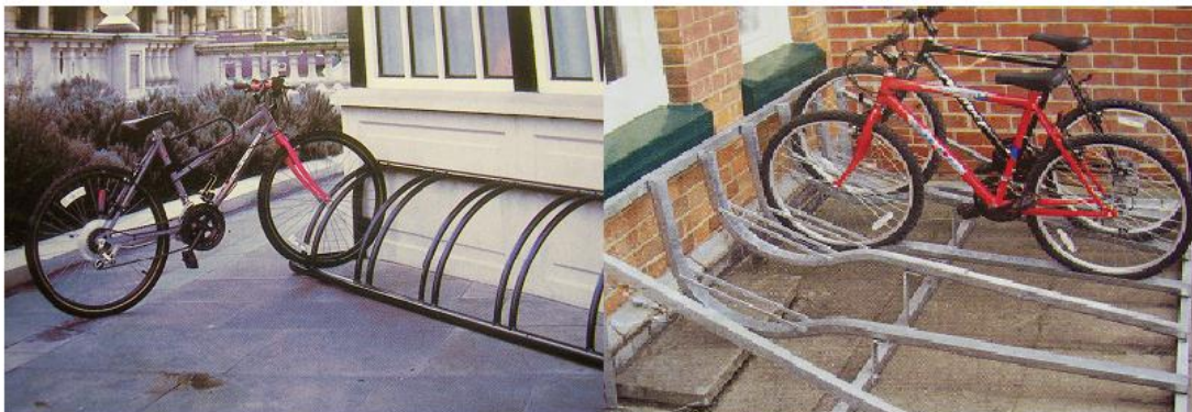
Fig 4: Unsuitable racks that only allow the front or back wheel to be secured

11.1.4 Cycle parking facilities that only allow the front and/or back wheel to be secured (and not the frame) will not be permitted at developments in Trafford. These stands offer a greatly reduced level of security (since a thief can easily steal the main body of the bicycle leaving the wheel secured to the cycle parking device), do not support the bike frame sufficiently and can damage bicycle wheels (examples are pictured in Figure 4, below).