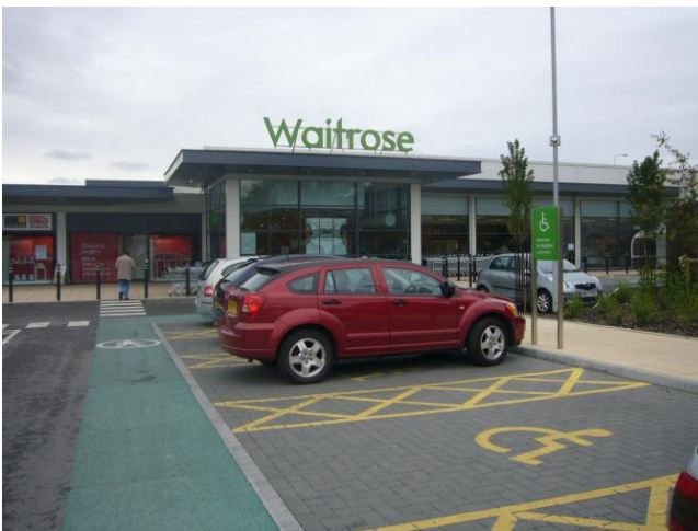
Fig 3: Example of appropriately located disability parking spaces and pedestrian route