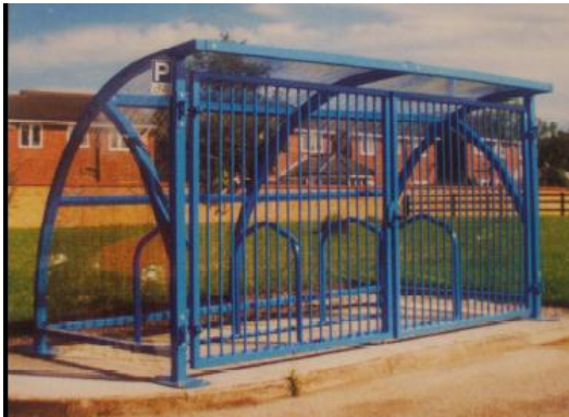
Fig 8: freestanding, covered, secure compound containing Sheffield stands