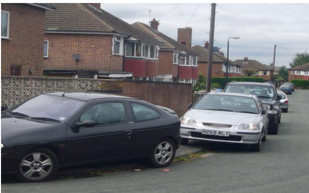
Fig 1: Example of inadequate level of residential parking resulting in on street parking.