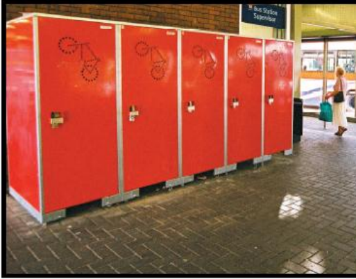
Fig 5: Vertical lockers are also considered unsuitable, since they cannot be used by some types of bicycle, and require lifting of the bicycle