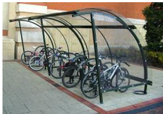
Fig 7: long stay open access cycle parking using covered Sheffield stands