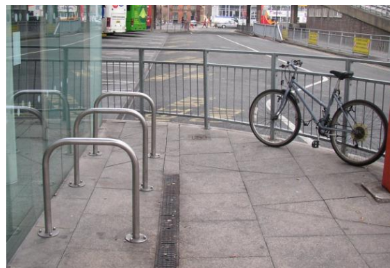
Fig 6: Poorly placed Sheffield stands: stands placed without sufficient clearance from surrounding walls and other objects will not be used.