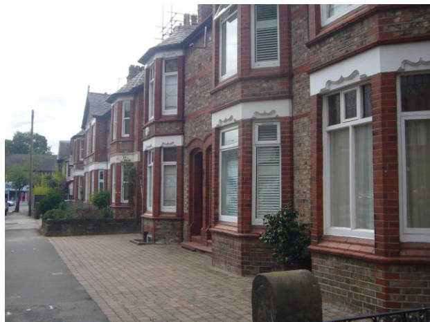
Fig 2: Example of loss of front gardens and boundary walls to hardstanding

6.3.4 In many instances, the development of forecourts has harmed the traditional layouts and setting of some streets through the loss of boundary features and mature vegetation. To reduce flood risk and retain the value and quality of the streetscape the Council will seek to retain front garden space and features such as original walls or landscaping. The conversion of front gardens to hardstanding will be discouraged. Where appropriate, the Council will remove permitted development rights on new residential developments to achieve this.