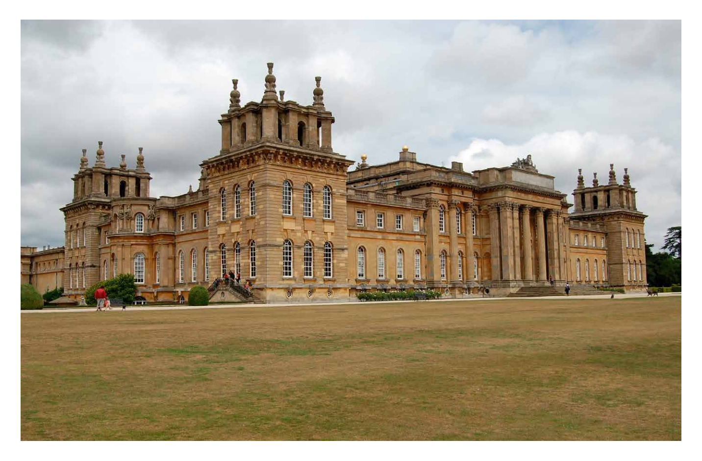
Figure 2 Blenheim Palace, Woodstock, Oxfordshire designed by Sir John Vanbrugh and Nicholas Hawksmoor, and built between 1706-29 represents the English

country house at its most significant. Listed Grade I it is also a UNESCO World Heritage Site.