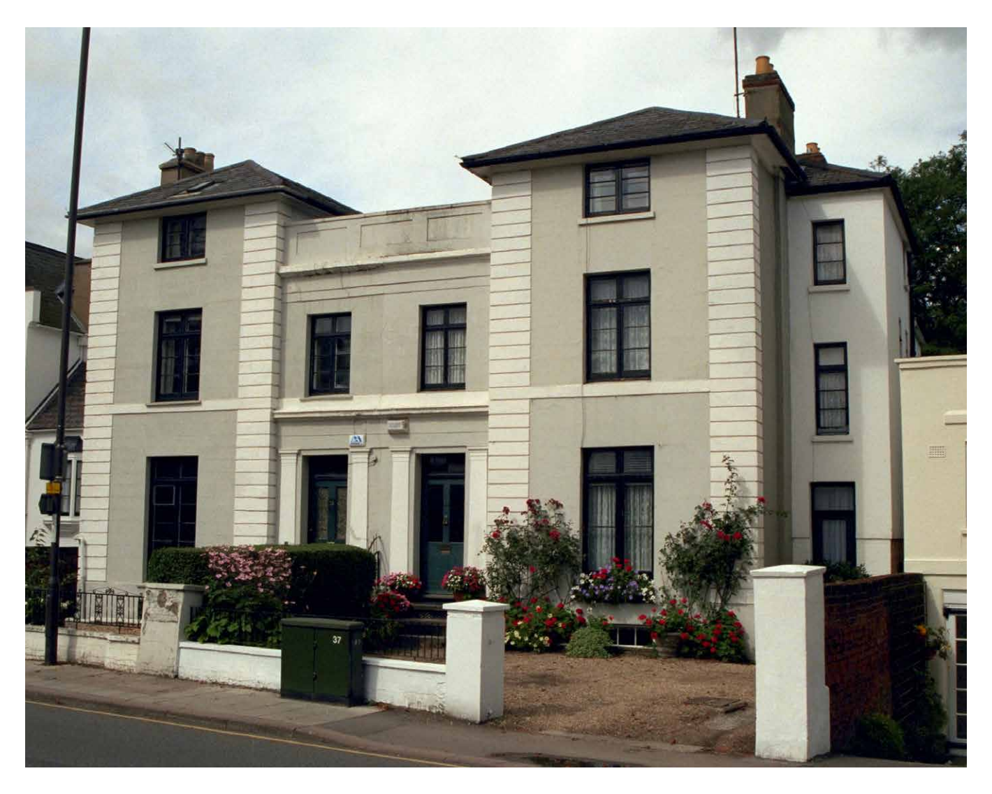
Figure 1 This pair of neo-classical stuccoed villas of the midnineteenth century in Bedford demonstrates

the introduction of the semi-detached house as an essential component of suburbia. Listed Grade II.