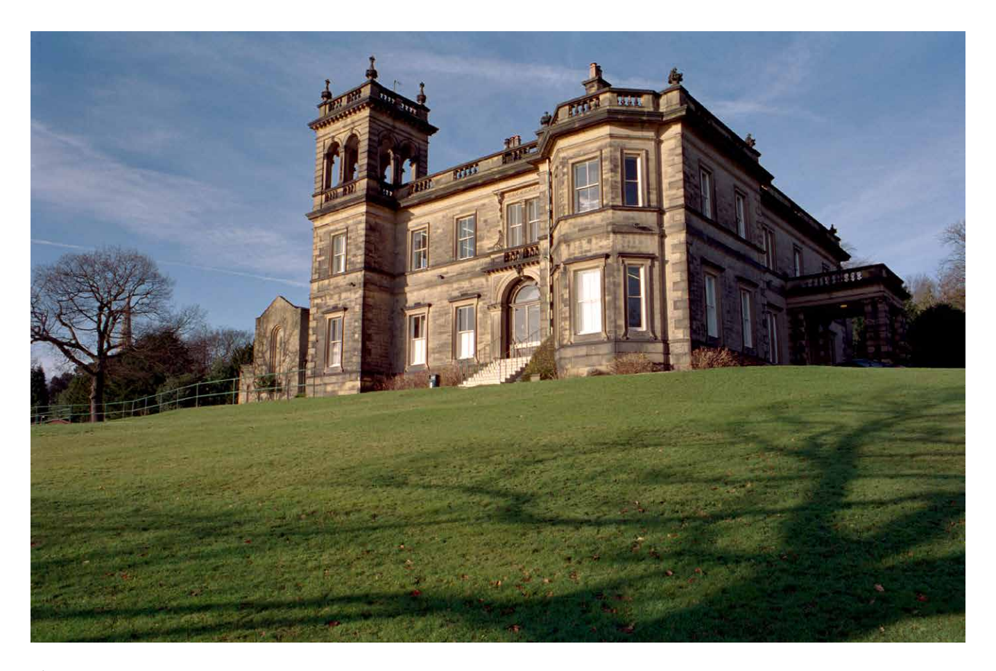
Figure 5 Grand mansions, such as Oakbrook House, Sheffield, designed for the steel magnate Mark Firth about

1855, ably demonstrates the wealth of the Victorian nouveaux riche. Listed Grade II.