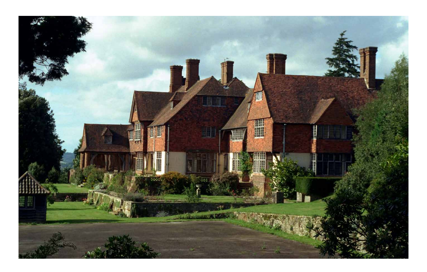
Figure 13 Churchill Court, Sevenoaks, Kent, was built in 1900 but only twenty years later was completely remodelled into this neo-Tudor house by Imrie and Angell.

Sydney Castle and Ernest Trobridge, have considerable verve and are already represented in the lists by examples such as Sheengate, Richmond (London Borough of Richmond) of 1924-5 by Castle. Many of the speculative-built suburban developments of the 1920s and 1930s adopted the planning and architecture of the Garden City Movement and its offshoot, the garden suburb, but sometimes skimped on the quality of materials, spacious garden plots and tree-lined streets: these are unlikely to warrant listing. However, more characterful or out-ofthe-ordinary developments may be worthy of recognition as conservation areas: examples include Homestead Park, Dollis Hill (London Borough of Brent) designed in 1926 by William E Sanders, and the Severne Estate, Hall Green, Birmingham, built in 1933 by H Dare and Sons.