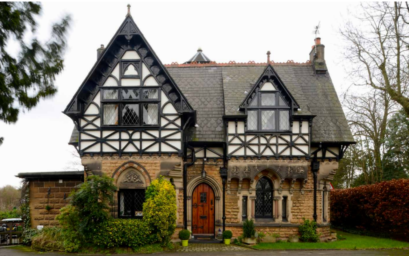
Figure 9 (top)