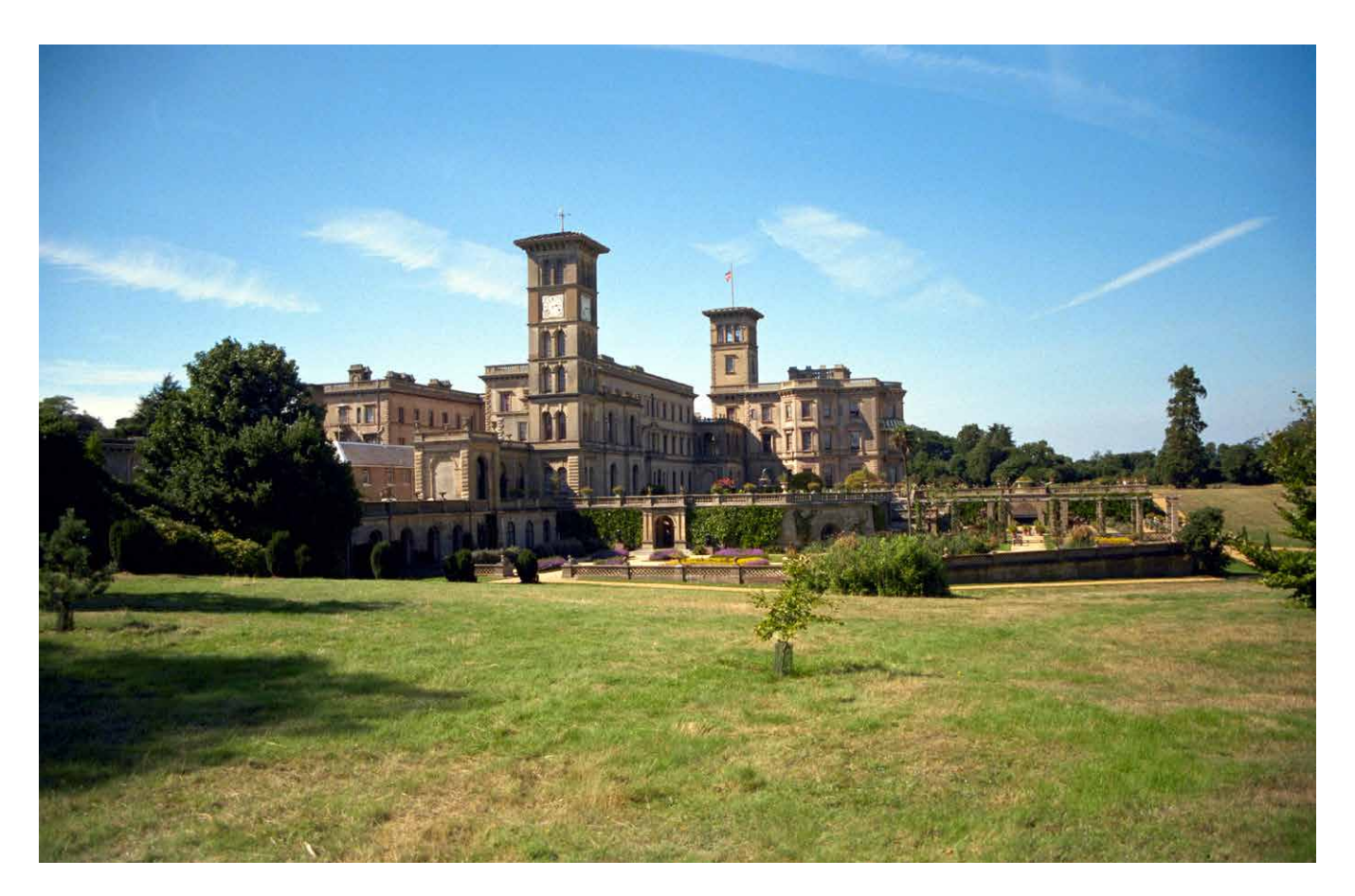
Figure 3 Osborne House, Isle of Wight, designed by Prince Albert in association with the master-builder Thomas Cubitt, 1846-51, employed an Italianate style which exerted

a considerable influence over suburban middle-class housing of the following decades. Listed Grade I.