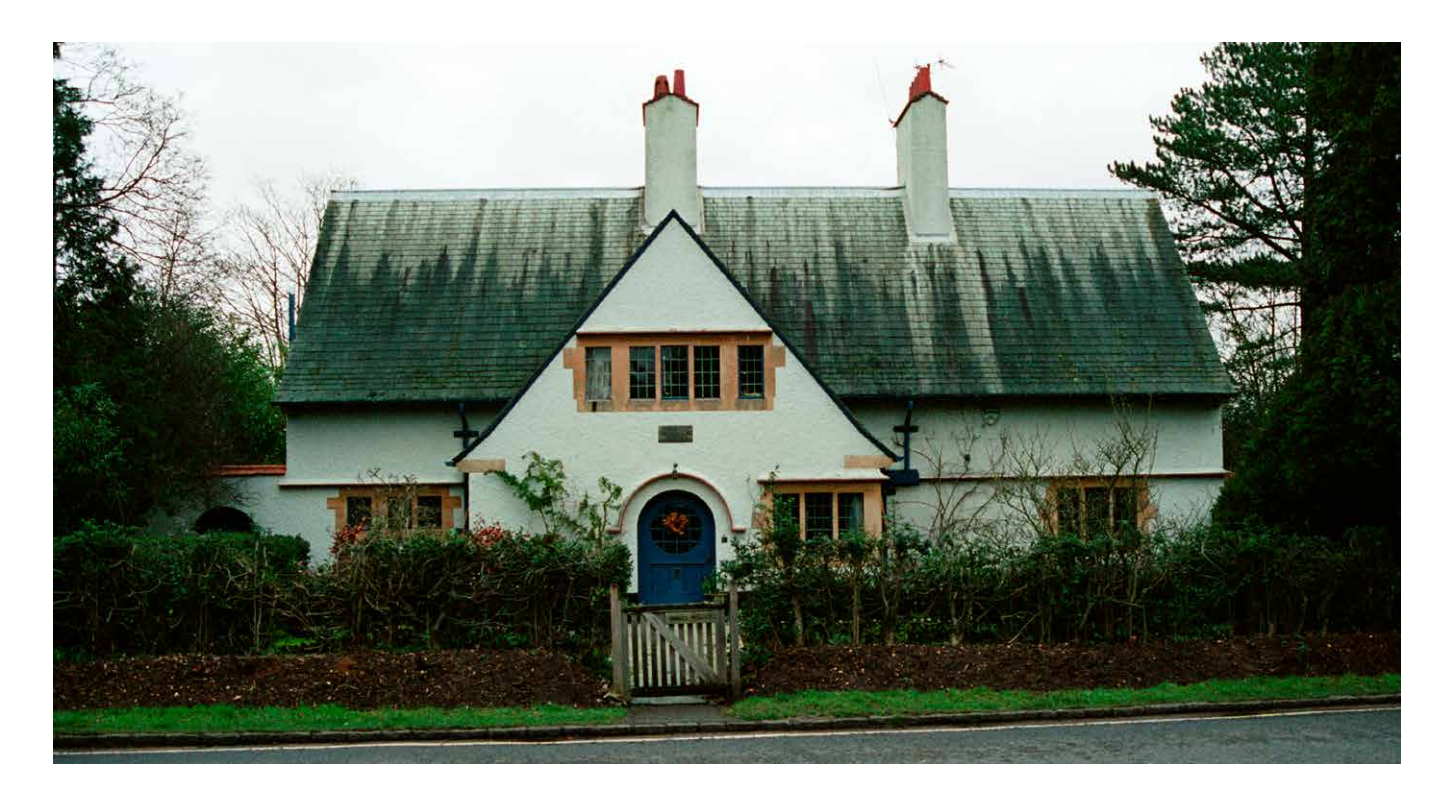
Figure 8 Perhaps more than any other architect Charles Voysey's Edwardian houses, such as 'Holly Mount', Penn,

Buckinghamshire of 1907, provided a model for the houses of inter-war suburbia. Listed Grade II*.