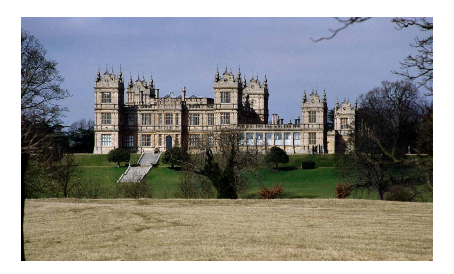
Figure 4 Mentmore House, Buckinghamshire, a conscious attempt on the part of Sir Joseph Paxton to copy the Elizabethan architecture of Wollaton Hall in Nottinghamshire for the Rothschild family in the

limes were applied as a facing, often over poor quality brick or rubble stone and lined to make it resemble fine ashlar as seen in buildings such as the Old Vicarage, West Dean, Sussex of 1833 (listed Grade II). As the housing market expanded from the late eighteenth century onwards so the appetite for substitute materials and massproduced building components (such as artificial (Coade) stone and iron balconies) increased. In the same period the use of Welsh slate for roof coverings became almost universal, partly because it was well-suited to the wide shallowpitched roofs that were then fashionable, but principally because canal transport greatly reduced its cost. However, the argument (common ever since) that such materials and practices have produced buildings of lesser significance than those which are unique and bespoke needs to be guarded against in any assessment.