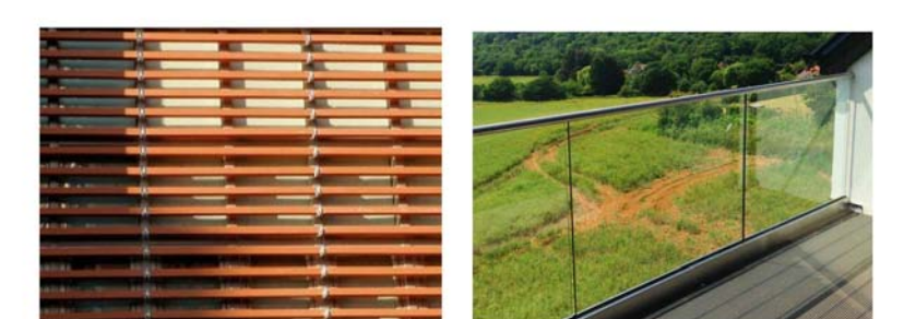
3. Teracotta baguette 4. Glass balustrade