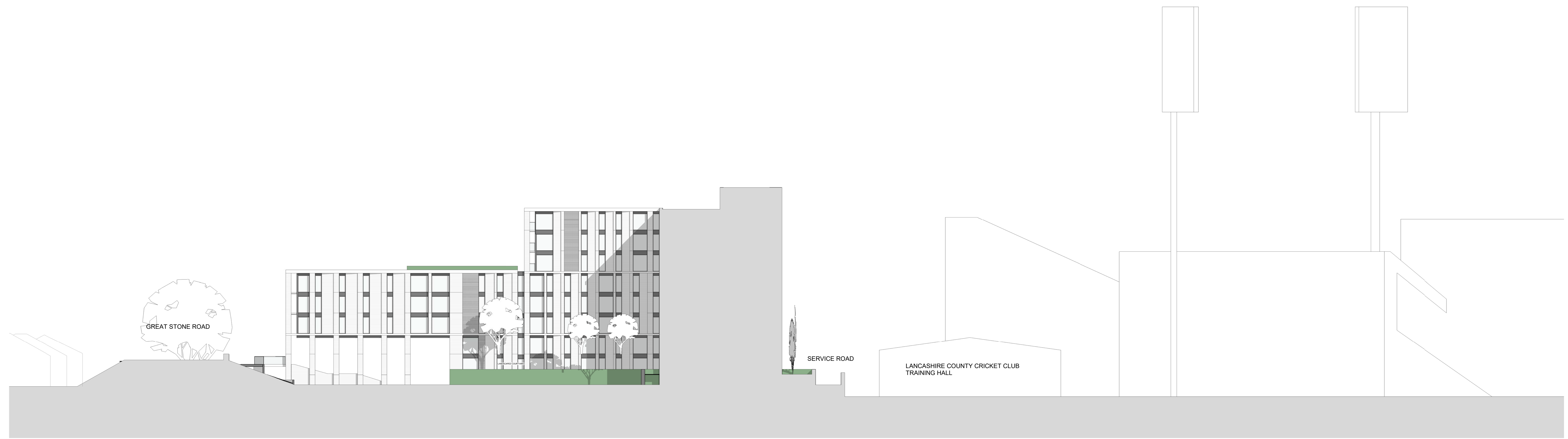
1 Courtyard Section BB 1 : 200

Notes: All dimensions are in millimetres unless stated otherwise. No dimensions to be scaled from drawings. All dimensions to be checked on site prior to manufacture. Any discrepancies between drawings and site conditions are to be reported to the contract manager. This drawing is to be read in conjunction with all relevant Structural Engineers and Mechanical & Electrical Engineers drawings and specification. Copyright of this drawing and all the information it contains is the sole property of OEA and may not be reproduced or used for any purpose without the express approval of the authors.