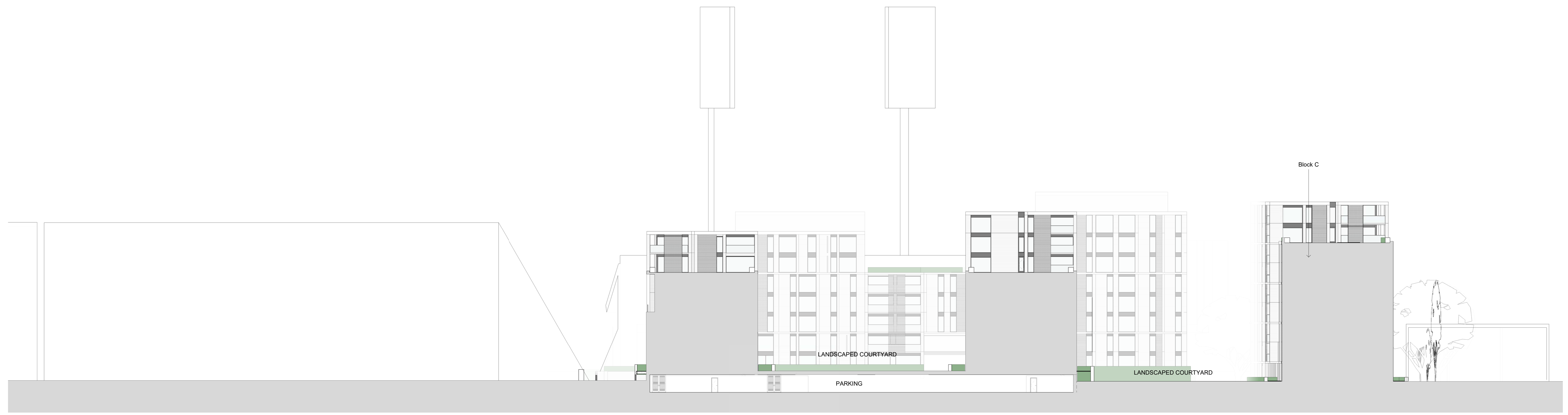
1 Courtyard Section CC 1:200

Notes: All dimensions are in millimetres unless stated otherwise. No dimensions to be scaled from drawings. All dimensions to be checked on site prior to manufacture. Any discrepancies between drawings and site conditions are to be reported to the contract manager. This drawing is to be read in conjunction with all relevant Structural Engineers and Mechanical & Electrical Engineers drawings and specification. Copyright of this drawing and all the information it contains is the sole property of OEA and may not be reproduced or used for any purpose without the express approval of the authors.