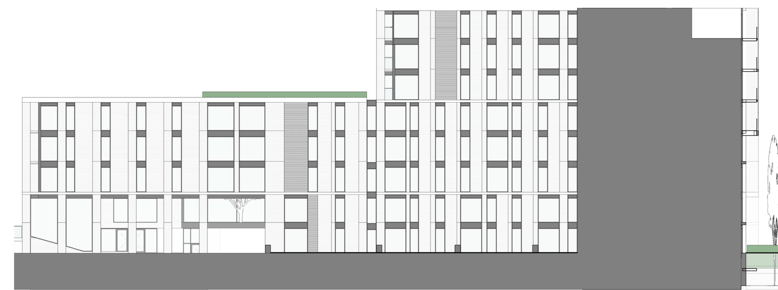
5 Elevation 5 1 : 200