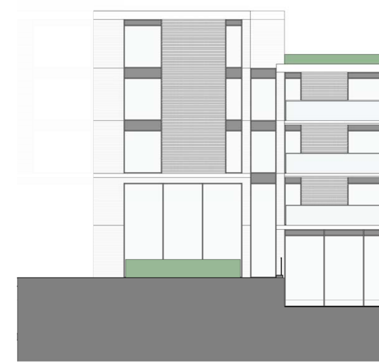
9 Elevation 4 1 : 200