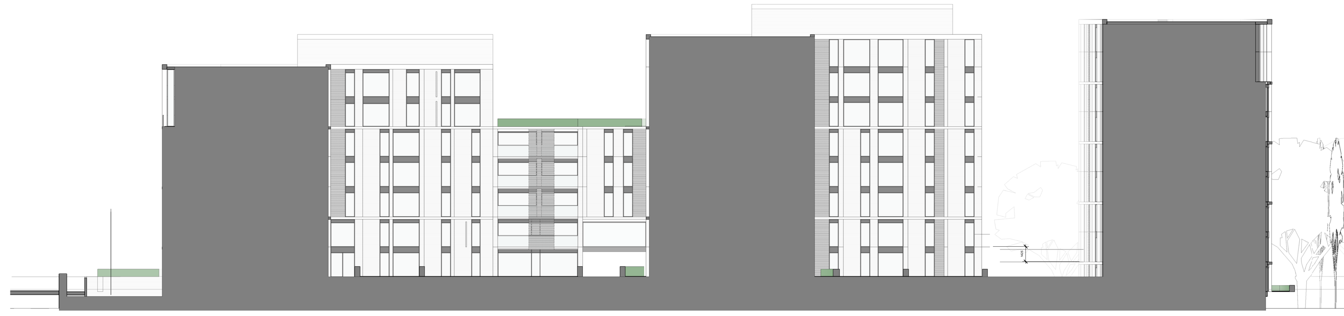
1 Elevation 1 1 : 200

Notes: All dimensions are in millimetres unless stated otherwise. No dimensions to be scaled from drawings. All dimensions to be checked on site prior to manufacture. Any discrepancies between drawings and site conditions are to be reported to the contract manager. This drawing is to be read in conjunction with all relevant Structural Engineers and Mechanical & Electrical Engineers drawings and specifications. Copyright of this drawing and all the information it contains is the sole property of OEA and may not be reproduced or used for any purpose without the express approval of the authors.