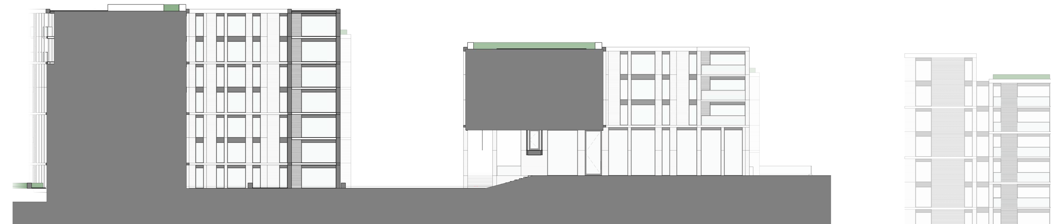
7 Elevation 7 1 : 200