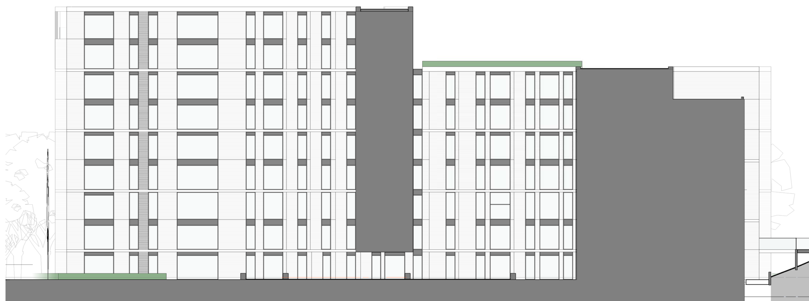
6 Elevation 6 1 : 200