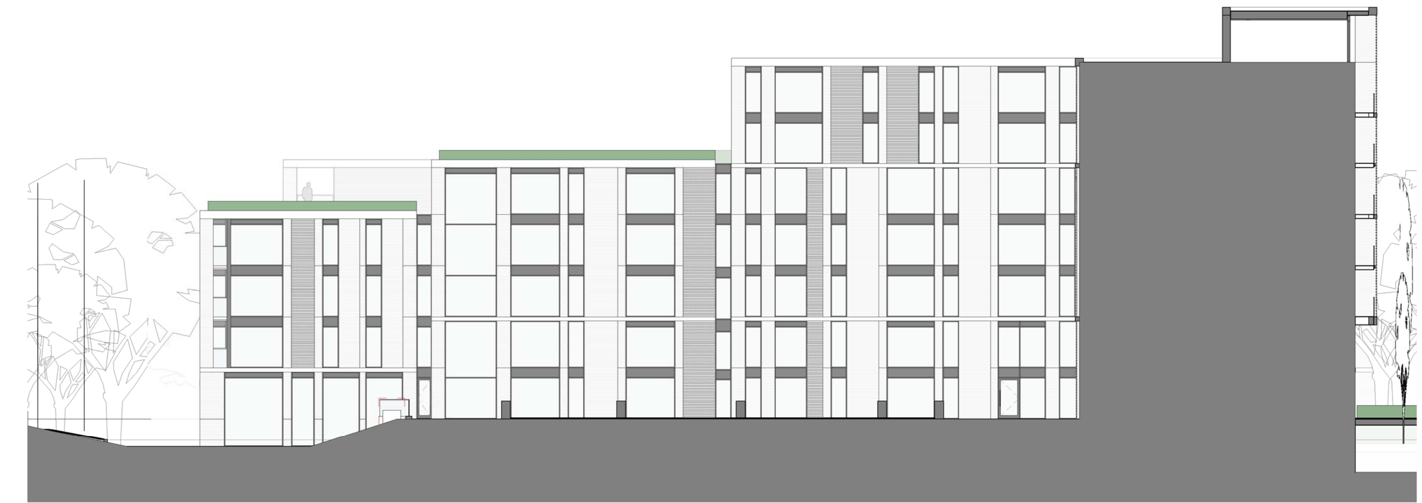
2 Elevation 2 1 : 200