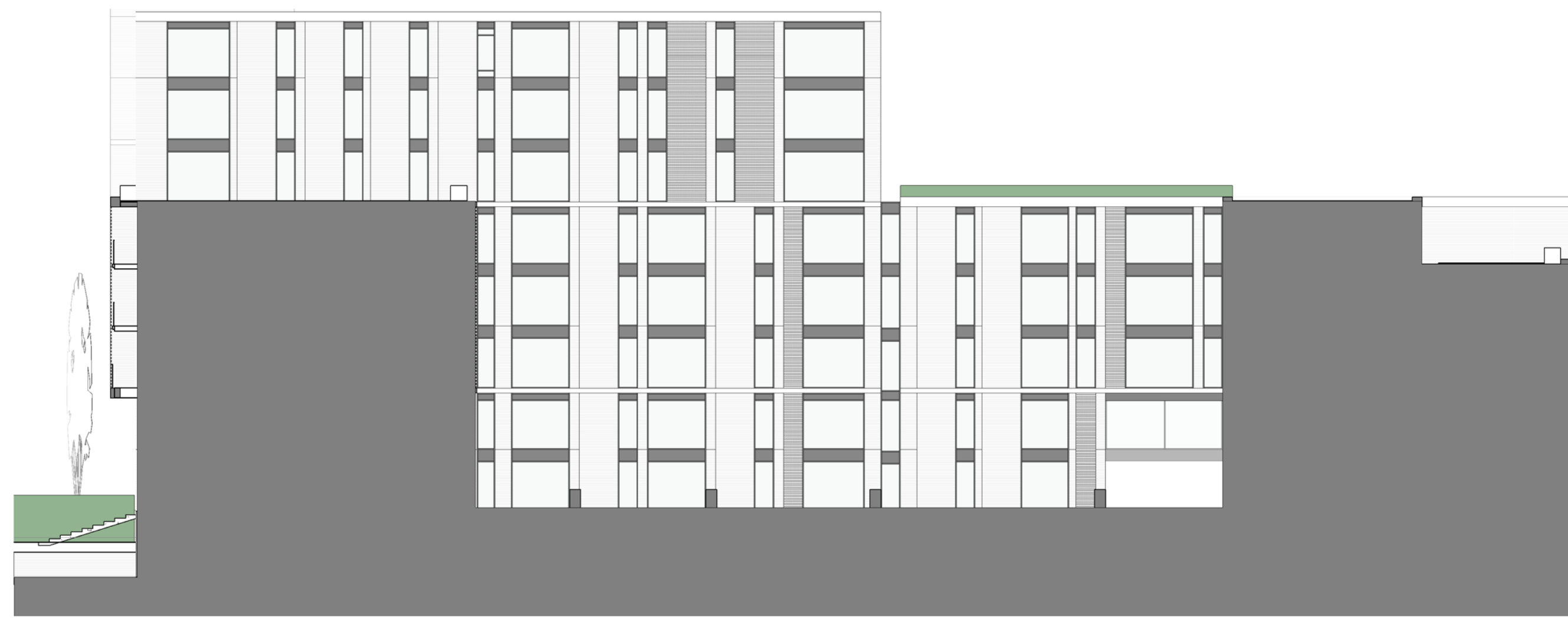
3 Elevation 3 1 : 200