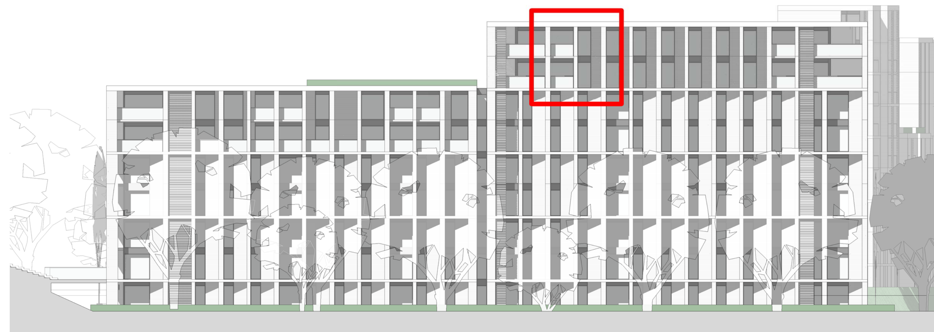
1 S-E Elevation - key 1 : 200