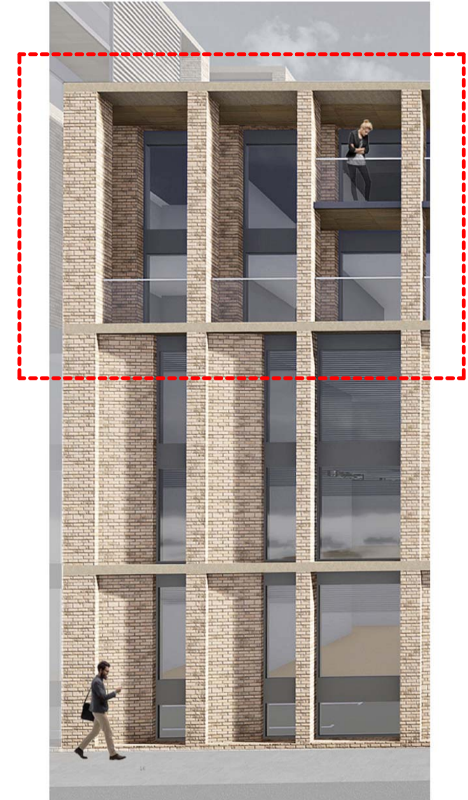
Indicative image of set back facade

Notes: All dimensions are in millimetres unless stated otherwise. No dimensions to be scaled from drawings. All dimensions to be checked on site prior to manufacture. Any discrepancies between drawings and site conditions are to be reported to the contract manager. This drawing is to be read in conjunction with all relevant Structural Engineers and Mechanical & Electrical Engineers drawings and specification. Copyright of this drawing and all the information it contains is the sole property of OEA and may not be reproduced or used for any purpose without the express approval of the authors