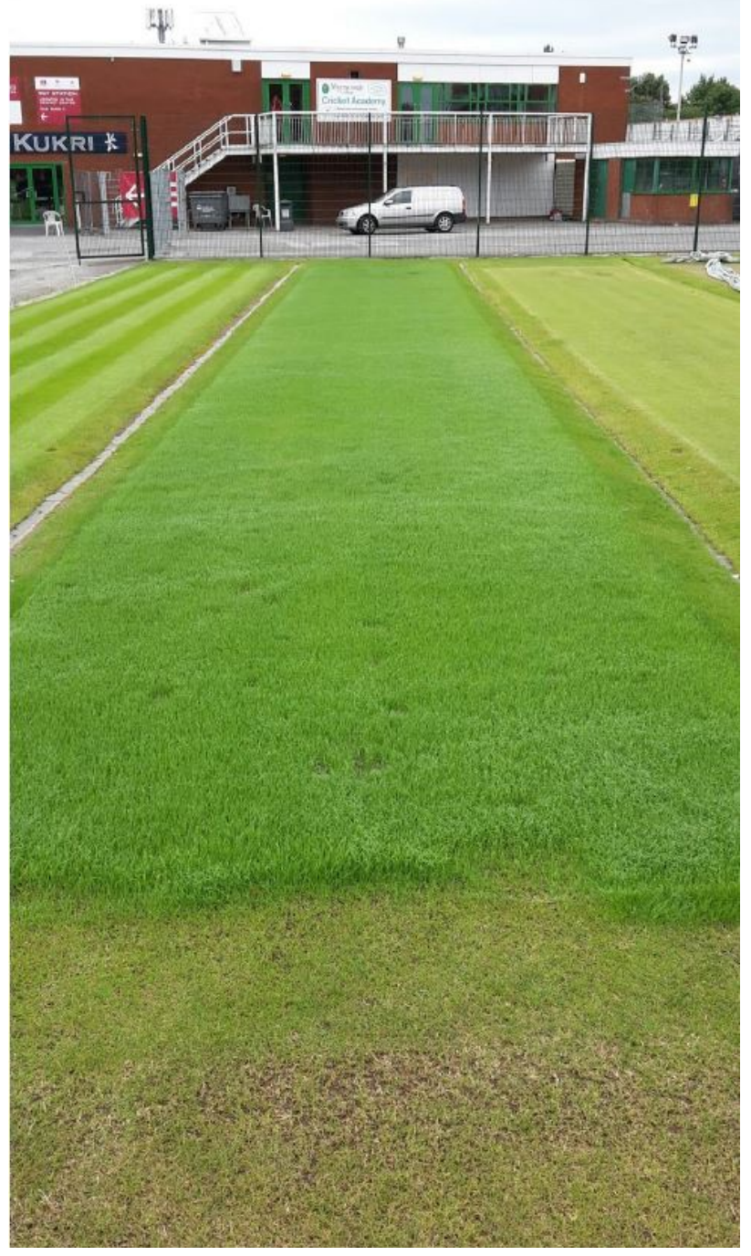
Fig 7: The ProNitro seed has clearly established quickly and has a good colour