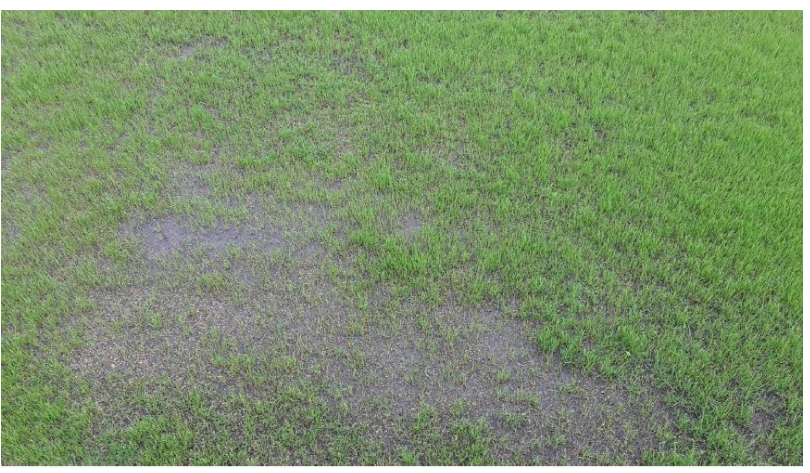
Fig 9: Growth was less successful in the foot-holes of the control seed