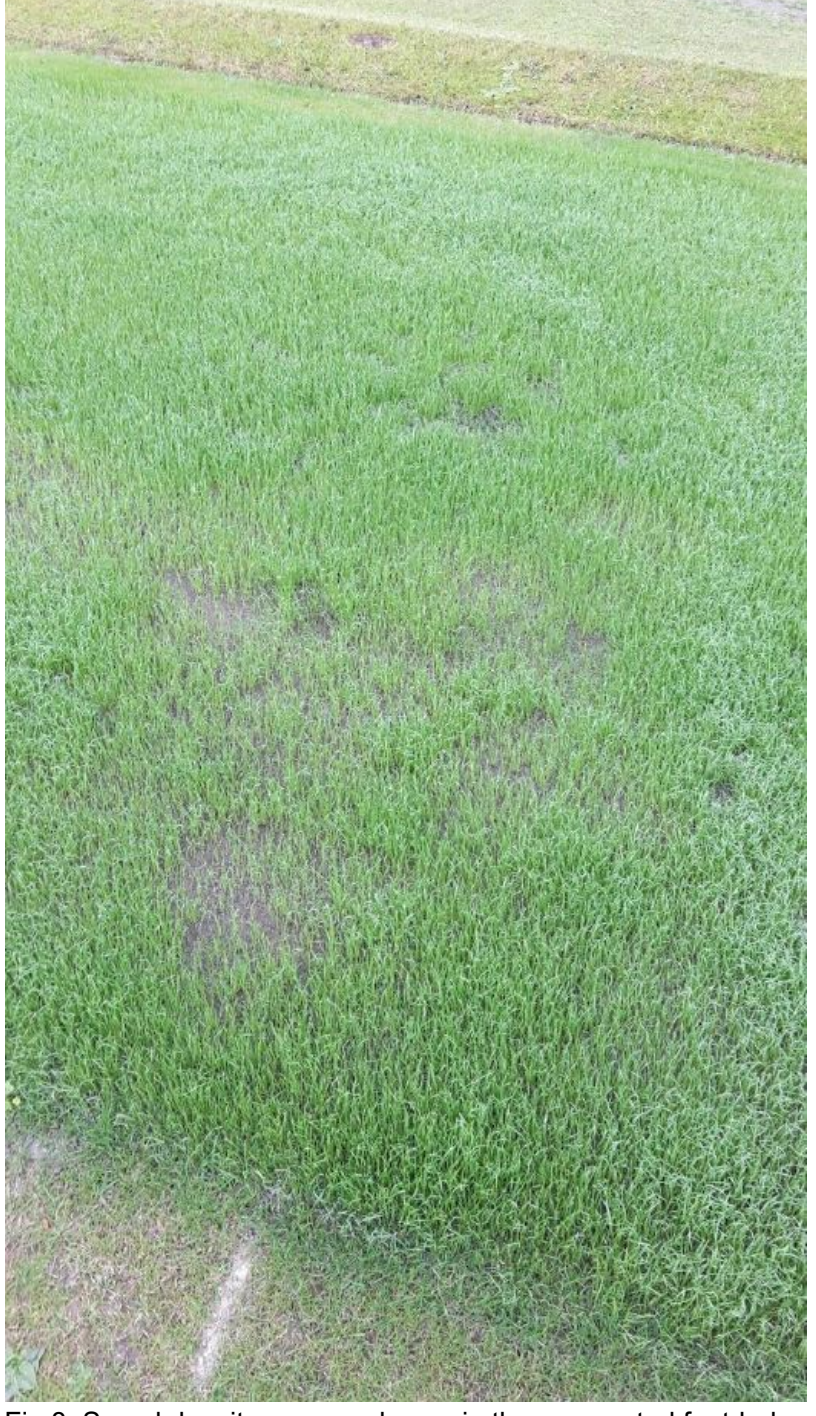
Fig 8: Sward density was good even in the compacted foot-hole areas of the wicket