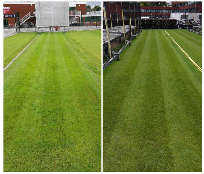
Fig 10: shows the ProNitro after the final asessment Fig 11: is the control wicket

Following the first cut after 14 days, the wickets were watered irregularly with rainfall being the main source of irrigation. Both areas showed signs of drought with the worst symptoms occurring in weeks 4-5 when each area lost its colour and growth was stunted. The control wicket was particularly affected by this, turning a rusty yellow colour with the Pronitro wicket turning a lighter green. Once recovered the control area regained its colour over a couple of weeks and the Pronitro remained consistent with good sward density and growth. (figures 10 and 11)