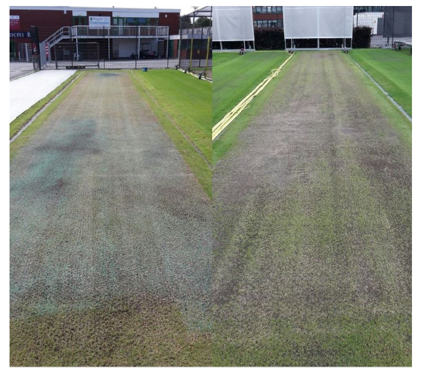
Fig 3:shows the wicket sown with ProNitro Fig4: shows the untreated control seed

Fig 1: Wicket 2 prepared for ProNitro Fig 2: Wicket 4 prepared for control