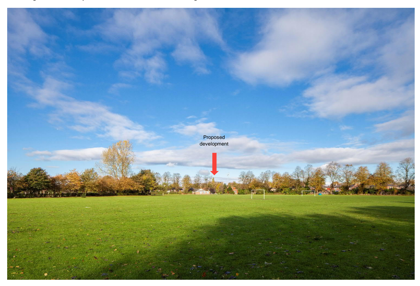
Visually Verified Montage 1: View looking north towards the site showing the extent to which the proposed development would be visible within views out of the Longford Conservation Area

Former B&Q Site, Great Stone Road, Stretford, M32 0YP Project No.: 62261726 | Our Ref No.: 62261726