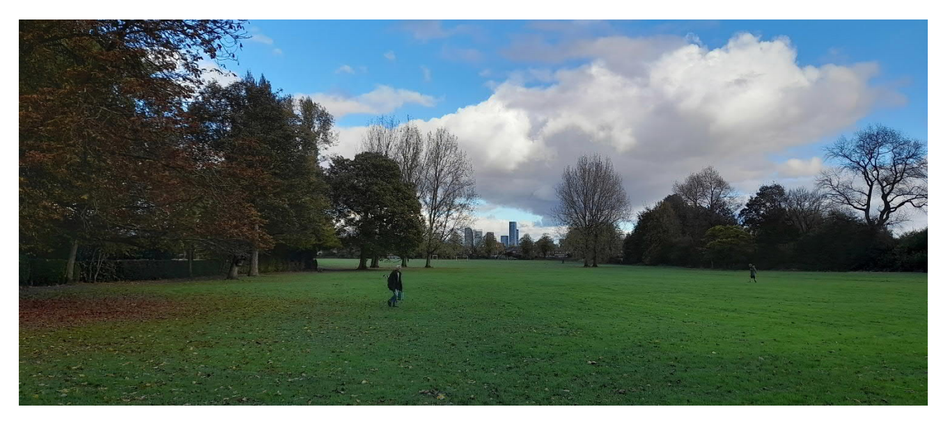
Photograph 1: View looking north-east towards Manchester city centre. A number of high-rise buildings are clearly visible in views out of Longford Park