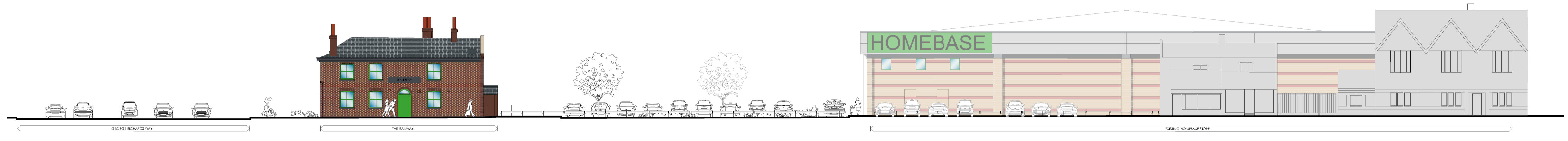
EXISTING ELEVATION - B - SIDE - FACING MANCHESTER ROAD - EAST