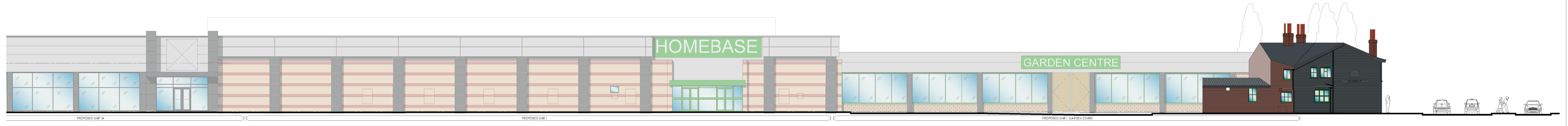
PROPOSED ELEVATION - A - FRONT - FACING GEORGE RICHARDS WAY & CAR PARK - SOUTH