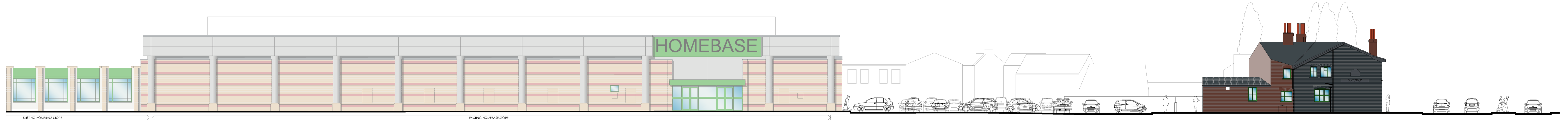
EXISTING ELEVATION - A - FRONT - FACING GEORGE RICHARDS WAY & CAR PARK - SOUTH