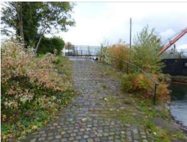
The municipal handrail along the Bridgewater Canal, with the safety fence on the far right

2.3.2 The more municipal style boundary treatments along the Bridgewater Canal – the plain black municipal handrail, white-painted bollards and standard safety fence – are incongruous and bear no relation to the boundary treatments in the western part of the Conservation Area. The rationalisation of a boundary treatment scheme along the two canals in particular would unify these two spaces. The railings established on the west side of Old Barton Road would be an appropriate option.