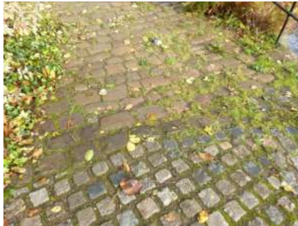
Historic cobbles and modern setts