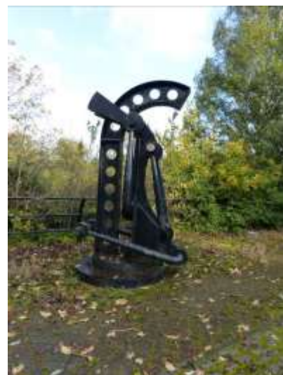
Canal-side features which should be explained in the interpretation scheme