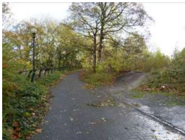
Lamp posts on Chapel Place