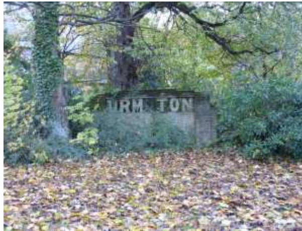
The Urmston sign, which is in need of repair