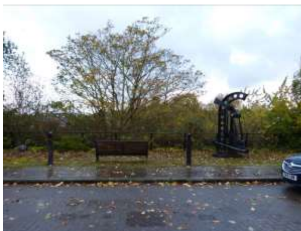
Features of an earlier public realm scheme on Old Barton Road, which are now redundant due to the overgrown embankment vegetation