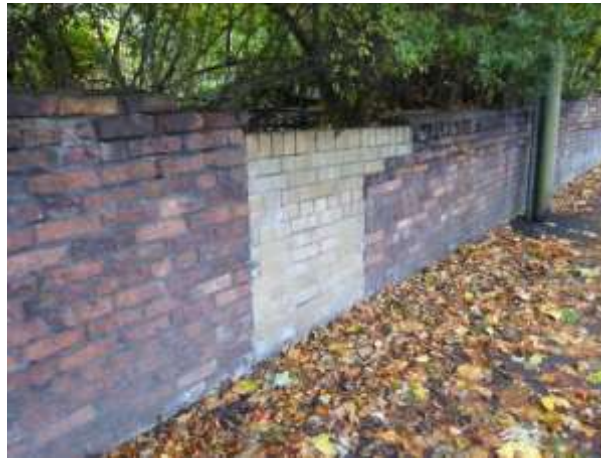
Inappropriate repairs to a historic brick boundary wall

2.3.2 The more municipal style boundary treatments along the Bridgewater Canal – the plain black municipal handrail, white-painted bollards and standard safety fence – are incongruous and bear no relation to the boundary treatments in the western part of the Conservation Area. The rationalisation of a boundary treatment scheme along the two canals in particular would unify these two spaces. The railings established on the west side of Old Barton Road would be an appropriate option.