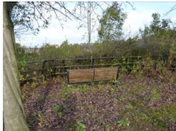
Overgrown but stylistically appropriate railings on Old Barton Road

2.3.3 There is evidence that the now-derelict houses on Chapel Place once had traditional front boundaries formed of upright slabs of roughly-hewn local masonry, which is typical of much of the Trafford area. These should be repaired and fully reinstated. The Redclyffe Road boundary walls of All Saints Church are of similar, roughly-hewn local masonry which is very heavily stained and would benefit from cleaning.