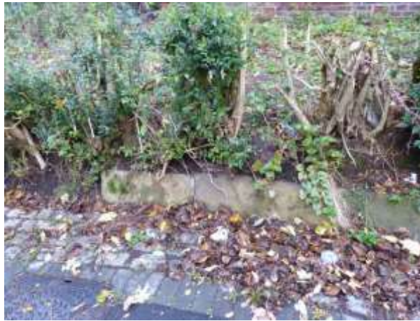
Boundary treatment in front of the derelict houses on Chapel Place