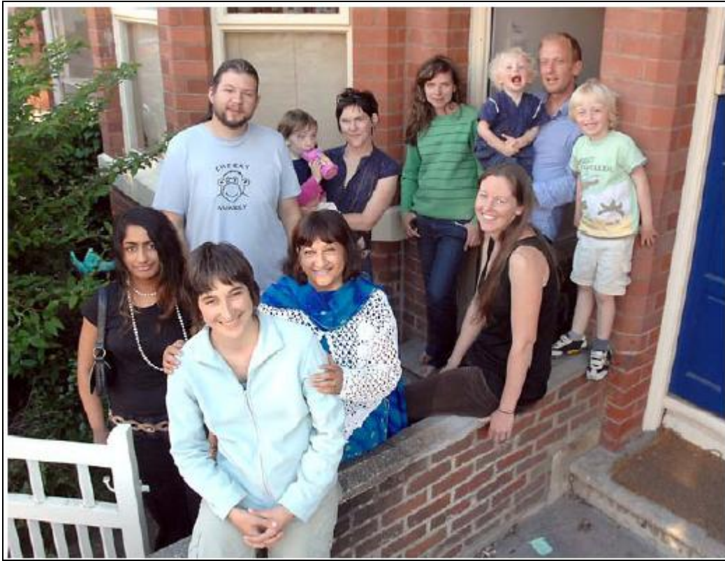
Photo: The families who received clean-burning wood stoves and solar hot water systems under the award-winning Old Trafford Renewables Project.