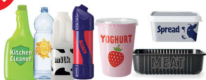
Plastic bottles, pots, tubs and trays