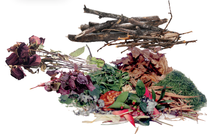
Garden waste permit only: Leaves, twigs, hedge clippings and grass cuttings (no japanese knotweed). Branches need to be smaller than 10cm diameter