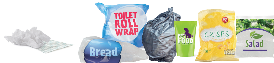
Tissues and wipes

These bins are for waste we cannot recycle