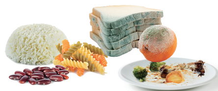
All cooked and uncooked food