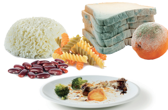
Raw, cooked or gone-off food (no oils, no liquids and no packaging)