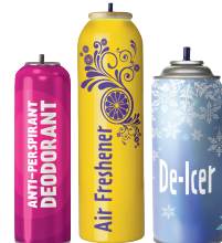
Empty aerosol cans