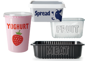
Plastic pots, trays and tubs