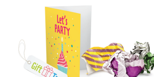
Non-glittery greeting cards and wrapping paper