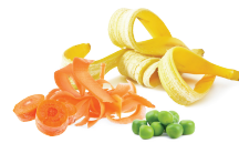
Fruit and veg peelings