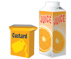
Food and drinks cartons

If we find wrong items in your recycling bins they won't get emptied