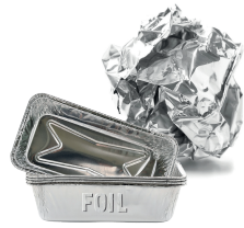
Foil and foil trays