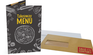
Letters and leaflets