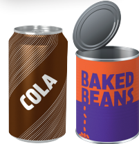
Cans and tins