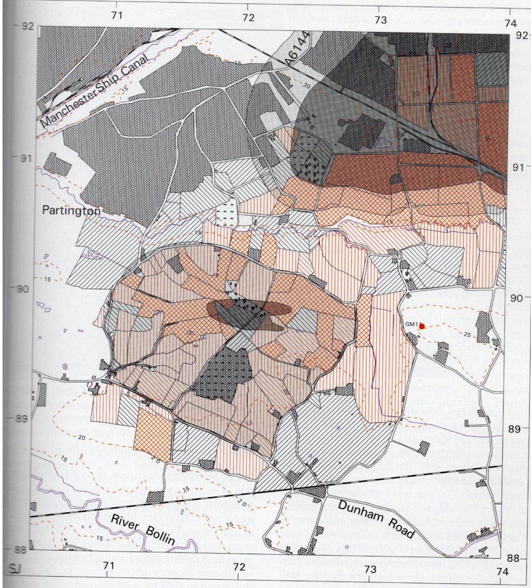
Fig 59 Warburton Moss: land-use, fieldwork, and peat and skirtland