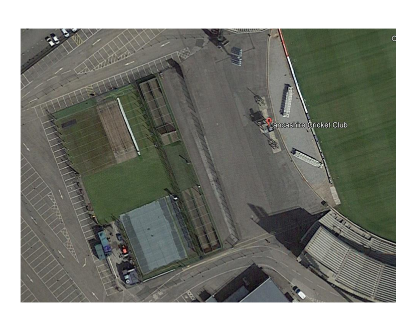
Fig 1 – Google aerial illustrating Old Trafford's use of germination sheets

As the shading caused by the proposed development is transitory, the western half of the training area block shows minimal shading in the first half of the morning, with some shade during midday, before it clears again in the afternoon. The temperature of the immediate microclimate can be mitigated