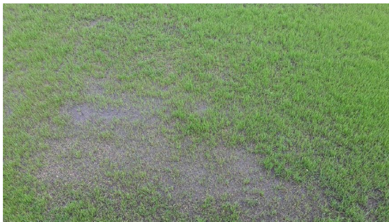
Fig 9: Growth was less successful in the foot-holes of the control seed