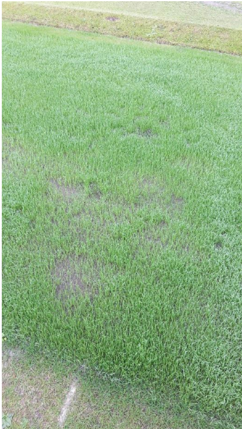
Fig 8: Sward density was good even in the compacted foot-hole areas of the wicket