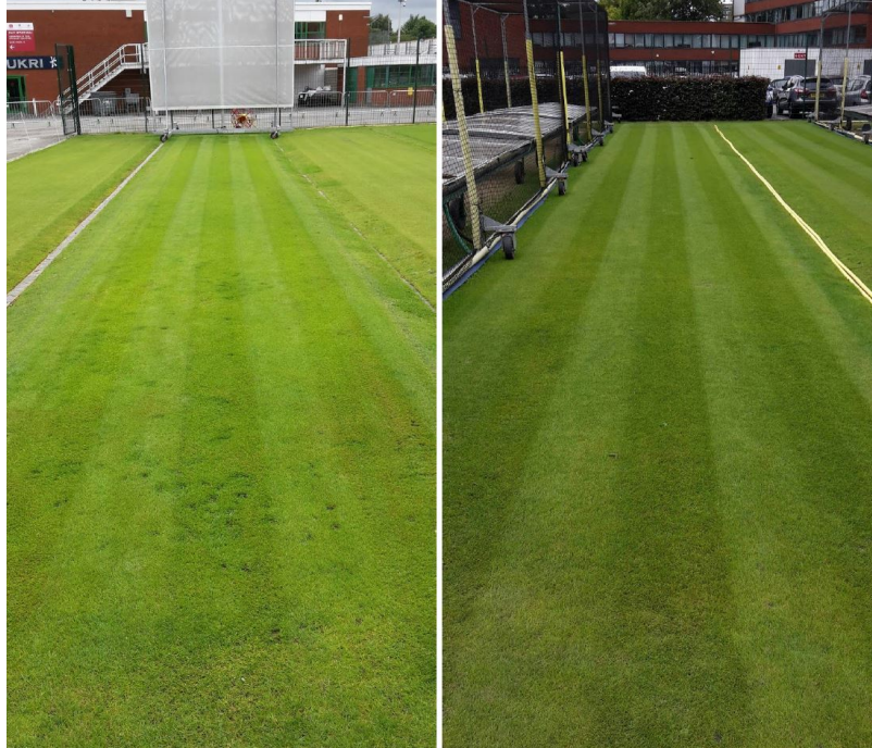
Fig 10: shows the ProNitro after the final assessment Fig 11: is the control wicket

Following the first cut after 14 days, the wickets were watered irregularly with rainfall being the main source of irrigation. Both areas showed signs of drought with the worst symptoms occurring in weeks 4-5 when each area lost its colour and growth was stunted. The control wicket was particularly affected by this, turning a rusty yellow colour with the Pronitro wicket turning a lighter green. Once recovered the control area regained its colour over a couple of weeks and the Pronitro remained consistent with good sward density and growth. (figures 10 and 11)