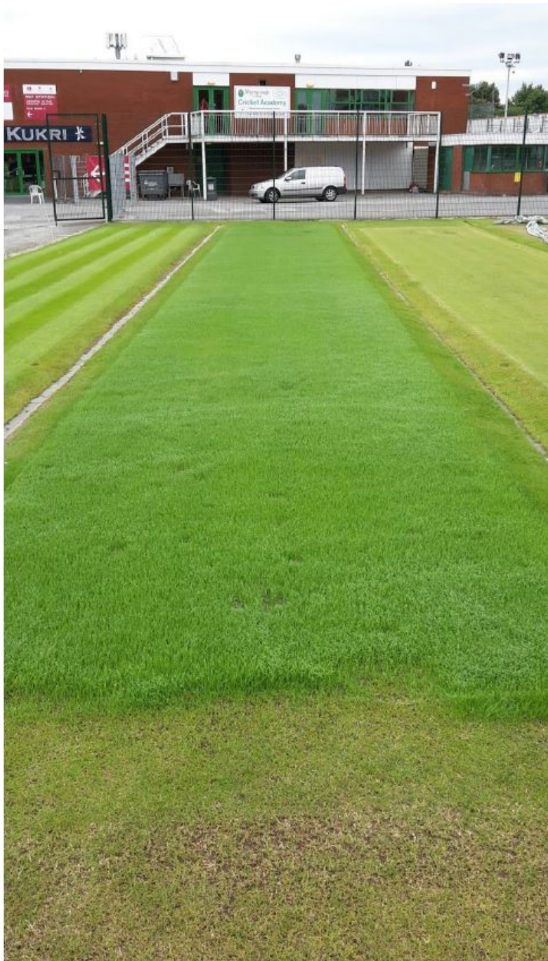
Fig 7: The ProNitro seed has clearly established quickly and has a good colour