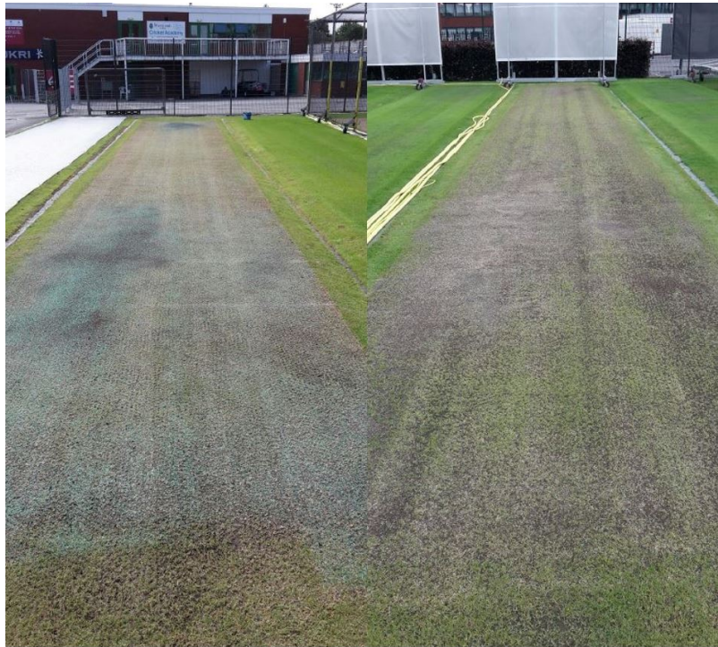
Fig 3: shows the wicket sown with ProNitro Fig 4: shows the untreated control seed

The germination sheets were left in place for 5 full days for each wicket before only being used over night from days 6 to 10. Each wicket received 2.7mm of irrigation for all but 2 of the first 13 days after sowing with the 2 days missed due to heavy rainfall. Overall the weather conditions during the trial were ideal for growth with temperatures reaching the mid20s during the day and only falling as low as 12-13 degrees overnight.