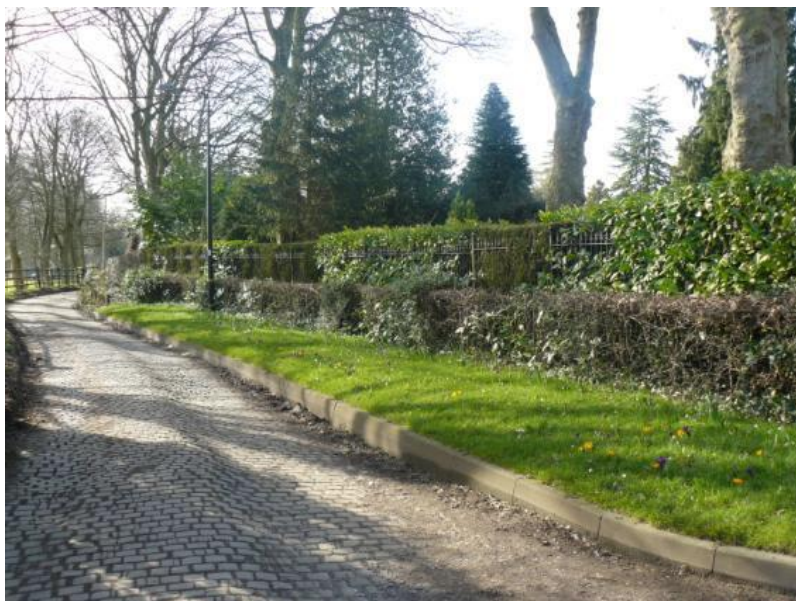
Surviving setts, which make a positive contribution to the character of the Conservation Area

2.5.2 The highway surfaces are primarily tarmacked, with evidence of patched repairs and some surviving historic cobbles or setts in areas. It would be beneficial to the aesthetic value of the Conservation Area and long-term condition of the roads if such repairs were consolidated. As previously mentioned, the volume of traffic going through the Conservation Area has been identified as an area of concern and a management strategy addressing this would help alleviate the knock-on effects it is having on the Conservation Area.