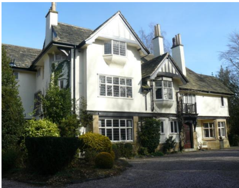
An example of the characteristic varied roofline, use of half-timbering and render