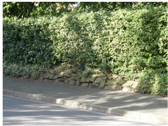
Left - inappropriate supplementary boundary treatment; Right – characteristic boundary treatment

2.4.3 Timber is an appropriate material for entrance gates. These should be of a high-quality design incorporating an open element and not exceeding 1.5m in height. Traditionally-designed wrought iron may also be appropriate. Side-hung gates are preferred over sliding alternatives and there are a number of surviving historic hinges throughout the Conservation Area which could be brought back into use. The characteristic historic gate posts of local stone should be retained where they survive and any new gates should be proportionate to these. Where new gate posts are to be inserted, local stone carved in a traditional manner is the preferred option. Overly-large gate posts in an unsympathetic