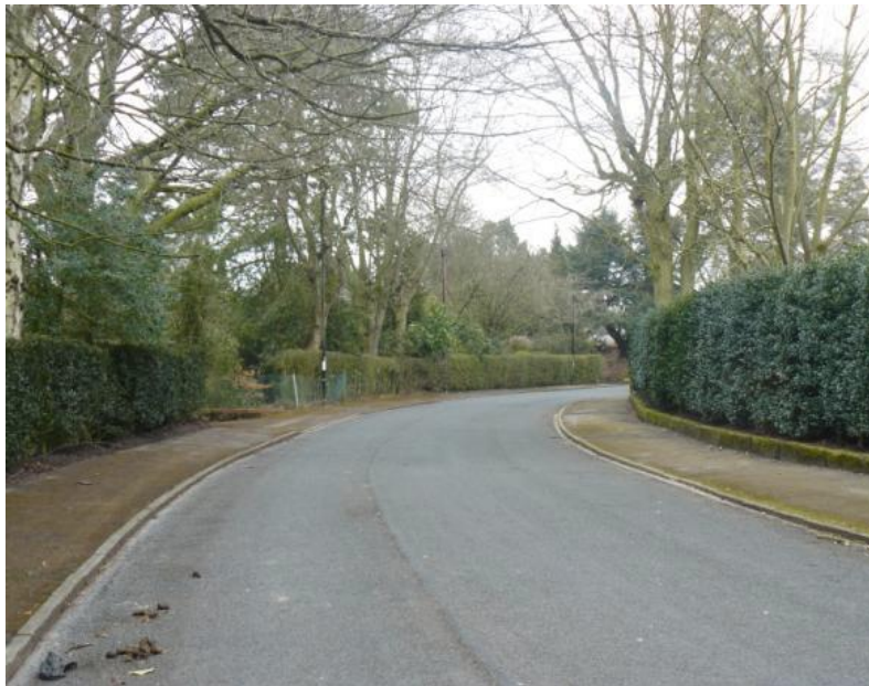
South Downs Drive, with established planting and a quality of pavement which is lacking elsewhere in the Conservation Area