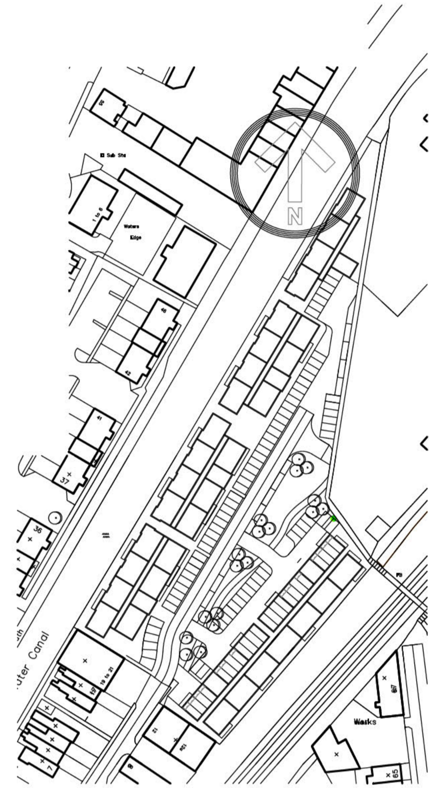
1:1250 Proposed Site at Britannia Rd, Sale...