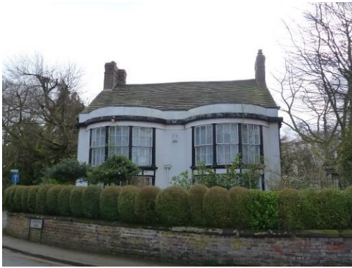
Big Tree House, with its distinctive bay windows