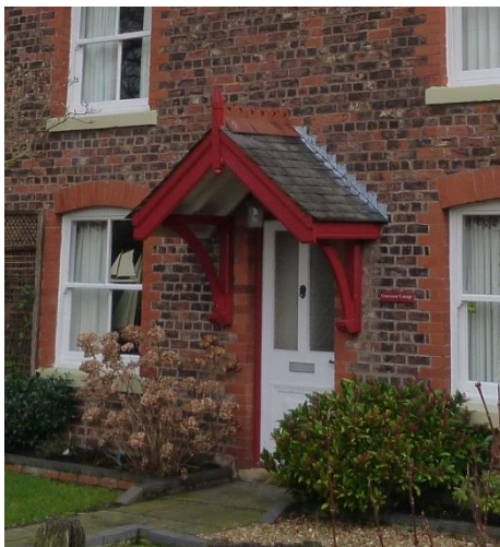
The open porch at Grosvenor Cottage

2.2.3 Chimneystacks are also quite prominent, different widths and heights indicating where they have historically been rebuilt or added later. A very small number of both open and closed porches are extant. These would not be an appropriate feature to introduce on the terraced cottages fronting directly onto the pavement.