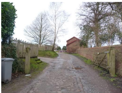
Surviving cobbles along the entrance to Dog Farm