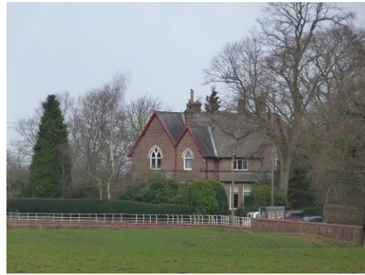
Bishop's Lodge, which has elements of a Gothic Revival Arts & Crafts style

2.2.5 The agricultural buildings are predominantly brick-built with traditional features such as side-hung doors and haylofts. These historic buildings should be retained rather than replaced with modern steel-framed alternatives. Being of brick construction, the size of the agricultural buildings is typically smaller than modern equivalents, which would detract from the established built scale. The windows are frequently Georgian in style (i.e. small panes) but with a characteristic bottom-hung top row which opens inwards.