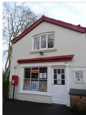
School Lane shop

2.9.1 There is one traditional shop front within the Conservation Area. The style of the shop front is entirely appropriate for its historic setting and its traditional features (stall riser, cornice, pilasters and semi-glazed door) should be retained.