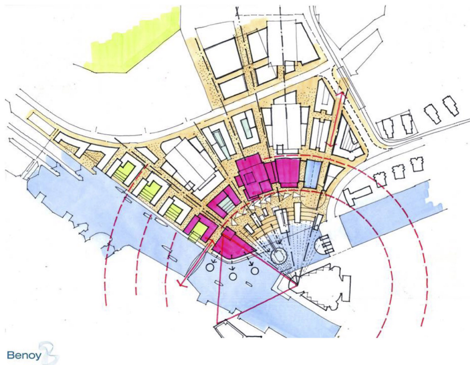
Figure 2.1 Typically, the road and public realm areas should radiate from the waterfront, with larger development plots to the north of Quays Point (towards Broadway)