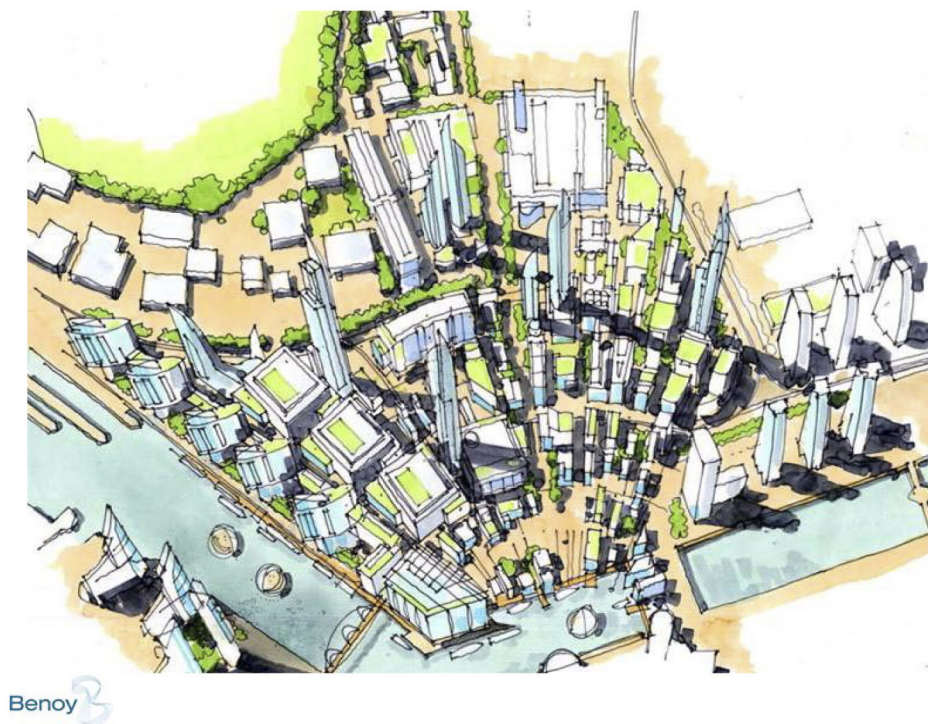
Figure 3.1 A String of taller buildings are envisaged along the northern and eastern boundary of the area, creating an identifiable and recognisable skyline in the vicinity of Broadway and the Broadway Metrolink Station