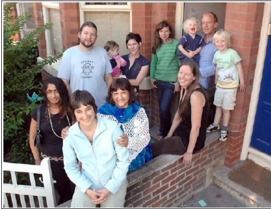
Photo: The families who received clean-burning wood stoves and solar hot water systems under the award-winning Old Trafford Renewables Project.