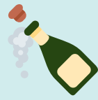
Alcohol drinks related